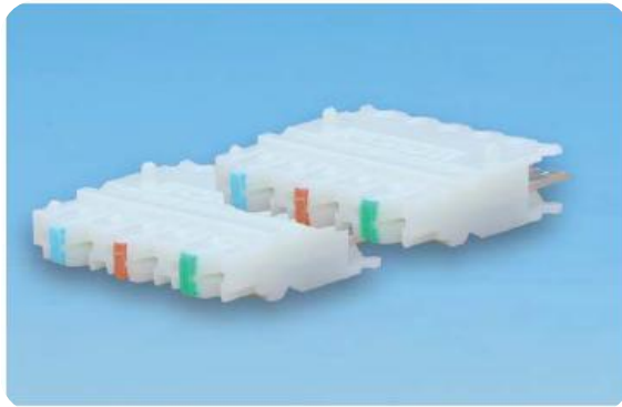
3 pair 110 Snap-on type IDC