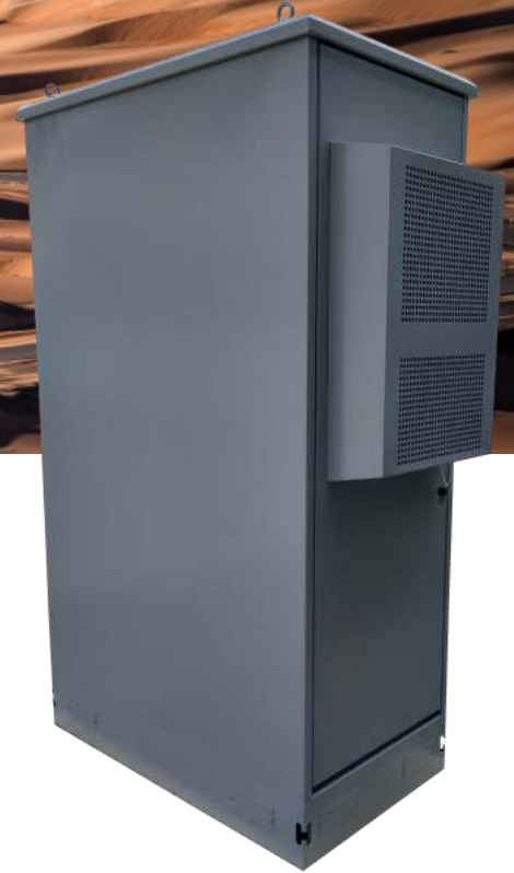
Floor Mount Type with Plinth