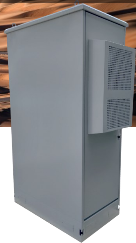
Floor Mount Type with Plinth

Note: Assembled Packing (Carton Box on Wooden Pallet) Options: Galvanized Sheet, 201 Stainless Steel, 304 Stainless Steel