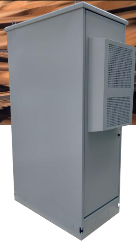
Floor Mount Type with Plinth